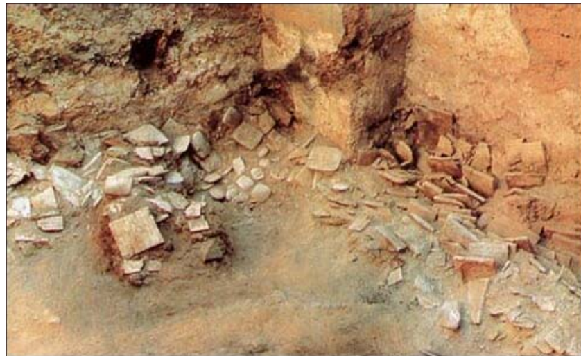
The archive of the Ebla tablets